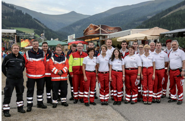
► Volunteers from Johanniter Austria and Johanniter Germany

Johanniter-Unfall-Hilfe Austria welcomed seven volunteers from Germany who supported them with the provision of ambulance services at a folk music event in the Carinthia region. The volunteers came from Johanniter-Unfall-Hilfe Germany's regional branches of Minden-Ravensberg, Lippe-Höxter and Stuttgart.