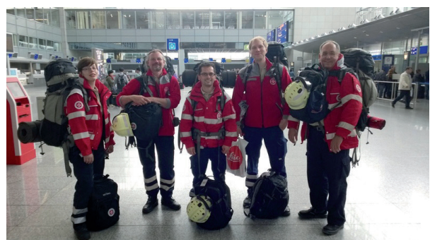
► Johanniter International Assistance emergency response team

Furthermore, Johanniter delivered medication and medical equipment to a local clinic to enable the basic medical treatment for 10,000 people for three months. More food and hygiene packages were distributed, as well as tents for 2,500 families in Sindhupalchowk province.