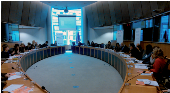
► Debate at the European Parliament