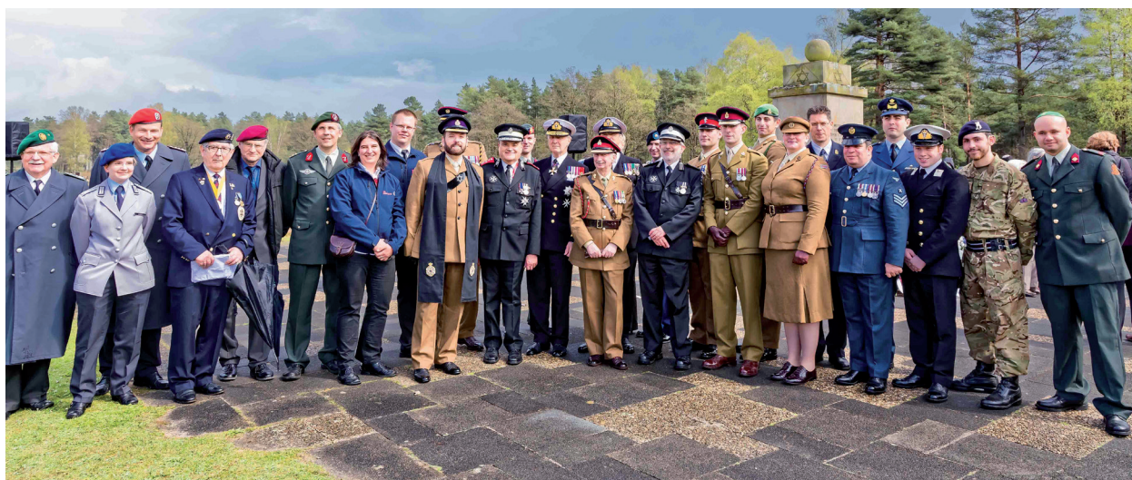
► Volunteers of St John Ambulance England and Johanniter Germany escorting members of the Association of Jewish Ex-Servicemen & Women in Bergen-Belsen

Several commemoration services were held throughout the day. The message that was sent out was one of hope interpreted through the different languages spoken, prayers from various religions, secular readings and a diverse group of people that attended the services.