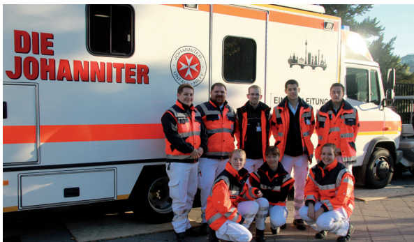
► Volunteers from Johanniter Austria