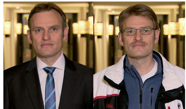
► before and after

In day centre for the elderly in Ahrensburg near Hamburg, he enthusiastically took part in the bingo games and group exercises. The next day brought another new task – helping prepare dinner for 150 hungry people in Schleswig by cutting giant cabbages in half and serving