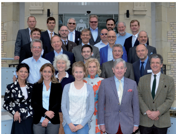
► The delegates of the JOIN AGM 2015