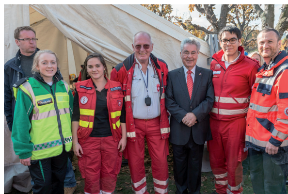
► Federal President of Austria Dr Heinz Fischer surrounded by volunteer of Johanniter Austria and St John Ambulance