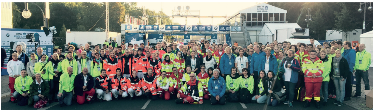
► Several volunteers from Johanniter Germany and Johanniter Austria

In 2015, the Berlin Johanniter regional branch was supported by other German Johanniter volunteers coming from Baden-Württemberg, Bergisch-Land, Bergstraße/Pfalz, Bremen, Cottbus, Desden, Düsseldorf, Hamburg, Leipzig, Leisnig, Minden-Ravensberg, Nürnberg, Oderland-Spree, Regensburg, Salzgitter, Schwabach and Wasserburg. An additional nine volunteers from Austria.