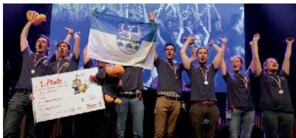
► Johanniter team from Essen that won first place

The 24th federal competition of Johanniter-Unfall-Hilfe Germany (Rescue Olympics) took place in the eastern German city of Cottbus at the "Spreeauenpark". JOIN members from Hungary and Poland were among the 400 participants who had to deal with a wide range of scenarios: road accidents, heart attacks, people falling of ladders, inline-skating accident's, etc. The aim of the competition was to address these critical situations as a first aider in the most efficient way. About 1,600