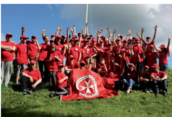
► St John volunteers from Finland, France, Germany, The Netherlands, Sweden and Canada

This year, Johanniterhjälpen Sweden was in charge of organising the annual summer camp for mentally and physically disabled Estonian youth in Talu, Estonia. The camp, which