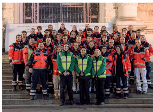
► Group picture of Johanniter Austria's volunteers with their three English colleagues in the front