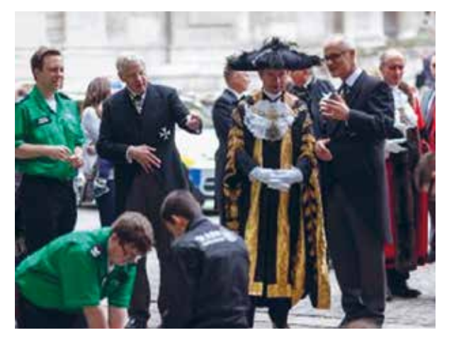
• His Royal Highness The Grand Prior meeting with cadets performing first aid demonstrations.