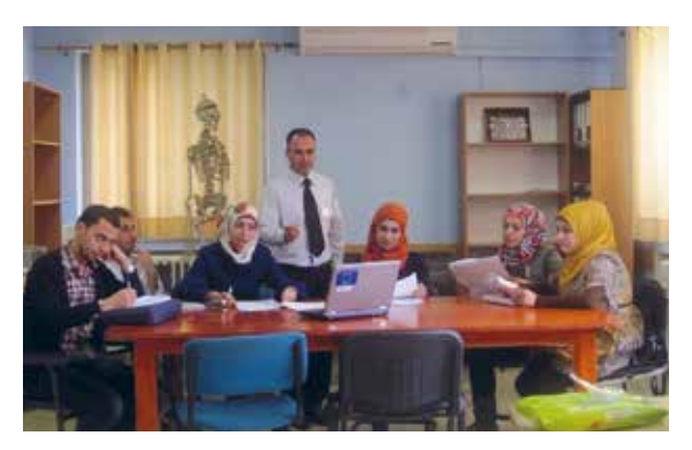
Staff of the St John of Jerusalem Eye Hospital Group

the end of the action. Meanwhile, a dedicated genetic laboratory will be established and equipped at SJEHG with close assistance of HMC by the end of 2017. The laboratory is expected to become operational in terms of DNA extraction and basic genetic screening that will be performed and supervised by the candidate.