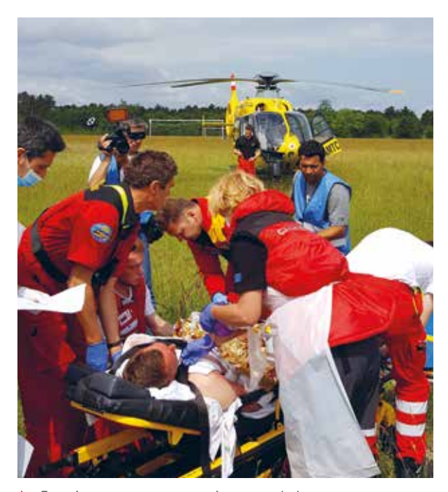
Exercise rescuers transporting wounded

Austria, Crisis Management Centre Finland, Danish Emergency Management Agency and the Italian Civil Protection Department.