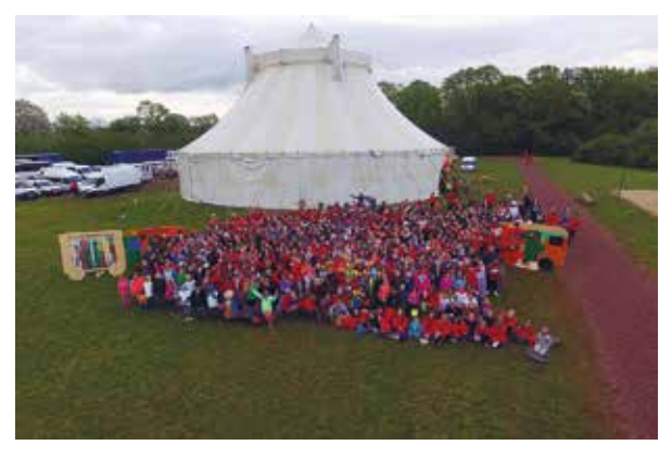
• A group picture of the participants

The weekend and program began early on Saturday morning with various thematic workshops on artistry, acrobatics, juggling, etc. Compared with the last edition two years ago – with daily temperatures of over 30° Celsius – the campers had to deal with much colder temperatures.