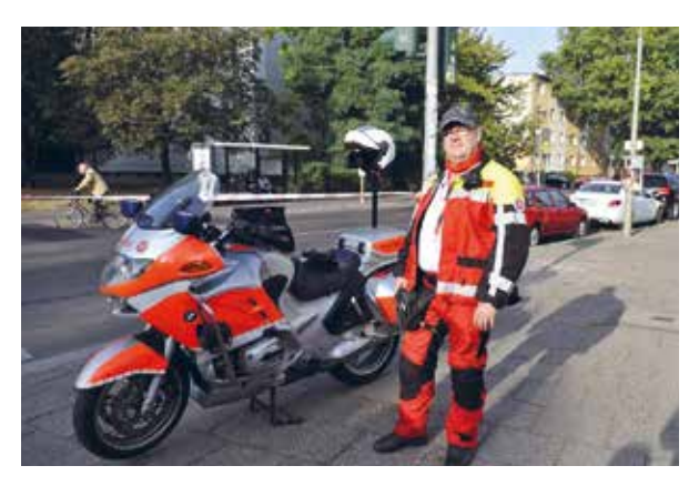
A German volunteer with its motorcycle

On Sunday, the day of the main race, St John volunteers staffed 25 help points along the route and in the finish area in order to look after the 40,000 runners as well as more than a million spectators. 10 emergency ambulances, 15 patient transport ambulances, 2 emergency medical service vehicles, 14 motorcycles, 1 bicycle and 28 foot patrols were present. JOIN members' services were required in 864 incidents and 57 patients had to be transported to the hospital.