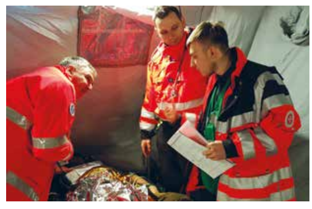
Rescuers in action

A total number of over 300 responders, local role-players, trainers and exercise staff contributed to the success of this exercise. A social event took place in the town of Tinglev to celebrate the end of the exercise.