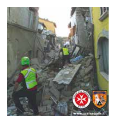
► S.O.G.IT sniffer dogs unit in the ruins of Amatrice

After the earthquake on the night of 23 August that stroke central Italy in the area around Amatrice, our Italian JOIN member S.O.G.IT mobilised its sniffer dogs. They worked rigorously to find and assist the survivors of the quake, despite the dangerous conditions caused by the aftershocks. The 6.2 magnitude-earthquake, along with the 98 aftershocks in the following 36 hours, greatly devasted the towns, demolishing buildings and trapping