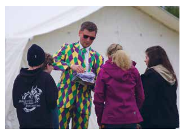
• A Pentecost Camp organiser giving instructions to young participants

Despite the cold, changeable weather and shivering faces, the participants kept up their high spirits and the camp site turned into a circus arena. At the Pentecost Camp, various activities were organised such as workshops, a night hike and a circus show fitting the motto.