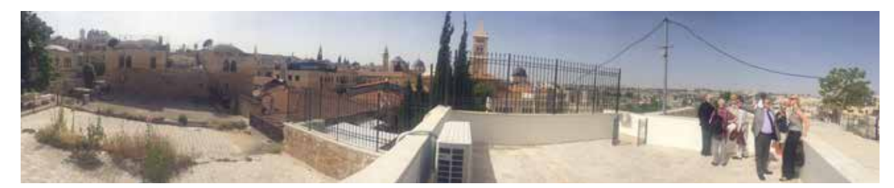
> The view from the building's roof on the Old City of Jerusalem

are ancient cisterns, tunnels and even tombs underneath the area - to turn the neighbouring space into a large garden and a tourist destination for the thousands of pilgrims and visitors that frequent the Old City each year.