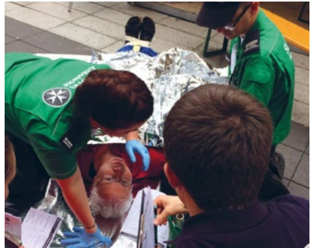
► The participants performed First Aid exercises

The first section of the competition was a 20-question, multiple choice paper, taken under strict exam conditions. The next challenge was a four-person team test. This was located in the town square which gave us a great opportunity to see the local scenery. The third challenge was for all six members of the team to diagnose three separate casualties in pairs. This was located across the square with locals watching a taking videos which gave Johanniter great publicity, promote skills and engage with the public. Next came the most difficult test - The Transport Test. Four members of the team were to carry a stretcher weighing 75kilos, with a small bowl of water fixed on a spindle which moved in a pendular motion when stretcher was lifted. The idea was not to spill the water and successfully transport the stretcher over the obstacle course in a reasonable time. Our final test was a four-person test in pairs performing CPR and using a defibrillator.