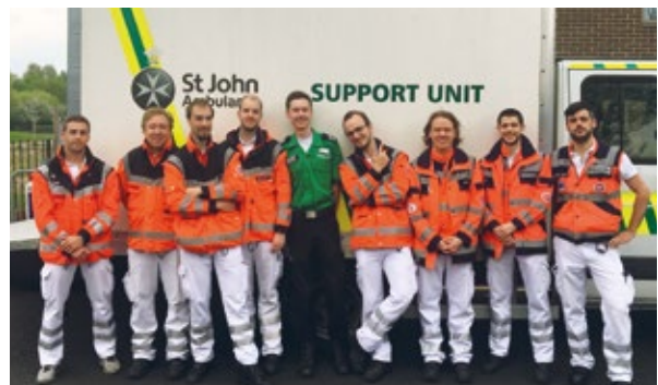
► Group picture of the Austrian volunteers.

The annual London Marathon saw over 40,000 runners pound the pavements around the British capital. Hundreds of thousands of spectators followed the race which was officially the hottest on record with temperatures rising to 24.1°C. St John Ambulance England and The Islands were out in force, making sure that everyone stayed as safe as possible. Our English JOIN member worked with London Ambulance Service and London Marathon medical teams to treat all kinds of conditions to injured runners and spectators – particularly heat related conditions due to the warm weather. Moreover, eight volunteers from Johanniter Austria came to London to assist colleagues of their sister organisation St John Ambulance.