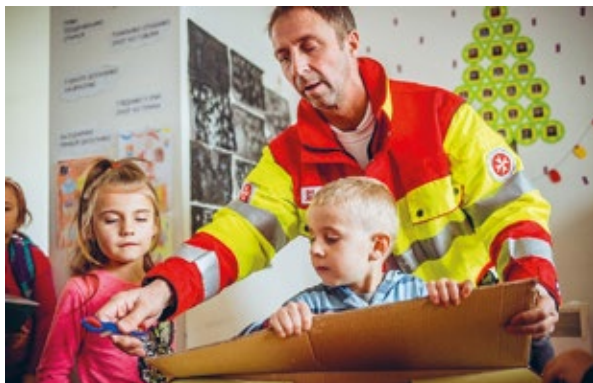
► Unpacking the parcels at a playschool

The action 'Johanniter-Christmas-Trucker' started in Bavaria 25 years ago and has since then expanded throughout Germany and for the first time also to Austria. This year, Northern Germany participated for the first time as well. Between Christmas and New Year's Eve members of Johanniter of all regions distributed the collected aid packages, which were brought to people in need in South-Eastern Europe. More than one hundred volunteers helped with the packing and delivery.