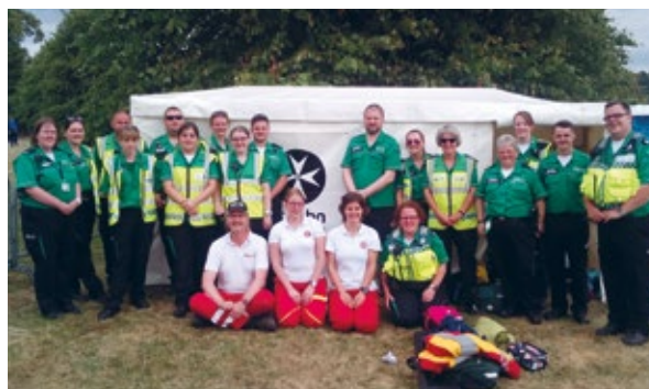
► Volunteers of St John Ambulance Northern Ireland and (in white shirts) volunteers from Johanniter Germany and Johannita Segítő Szolgálat Hungary.

in Banbridge, the Belfast parade and the Banbridge parade.