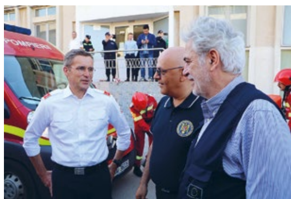
► The first day of the exercise with EU Commissioner Christos Stylianides

This was the fifth and final exercise this year conducted by a consortium of ten civil protection partners led by Johanniter Germany. Together with its partners our German JOIN member designed, placed, conducted and self-evaluated the exercise which simulated the