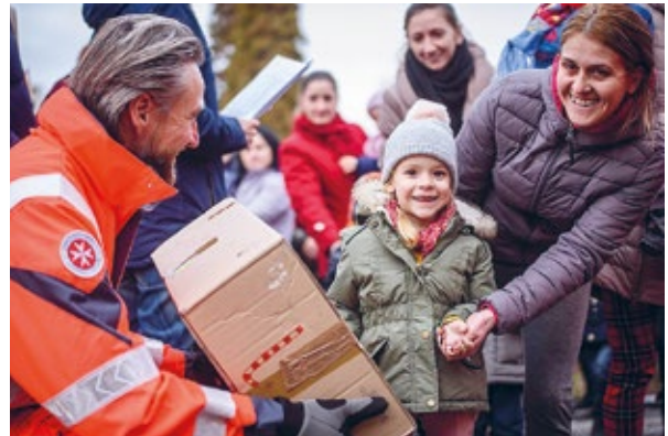
► Johanniter volunteers deliver the packages to locals

In Austria 50 helpers, volunteers and their families came together on 28 November to pack 1,500 packages worth EUR 8.100 on total.