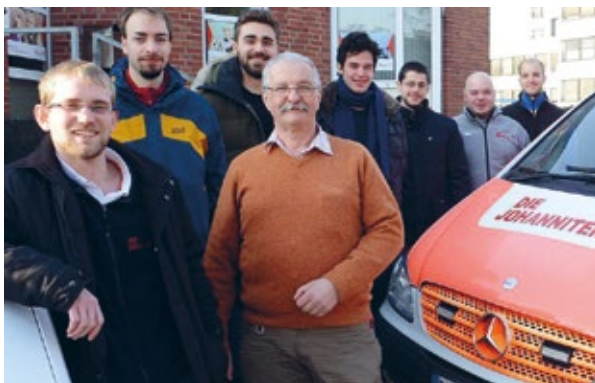
► The Austrian and German volunteers together.