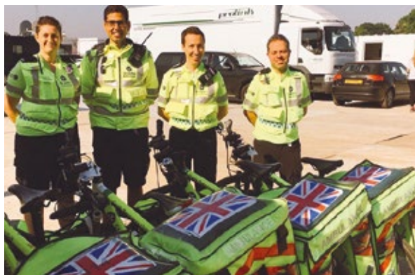
► Cycle Responders from St John Ambulance

As more than 100,000 people descended on Windsor to celebrate the Royal wedding of Prince Harry and Meghan Markle, they were welcomed with a reassuringly familiar sight – the green and black uniforms of our English JOIN member. Both within Windsor Castle itself and along the processional route, more than 100 St John's Ambulance's volunteers turned out for the baking hot day. SJA had treatment centers, cycle responders and numerous foot patrols ready to help.