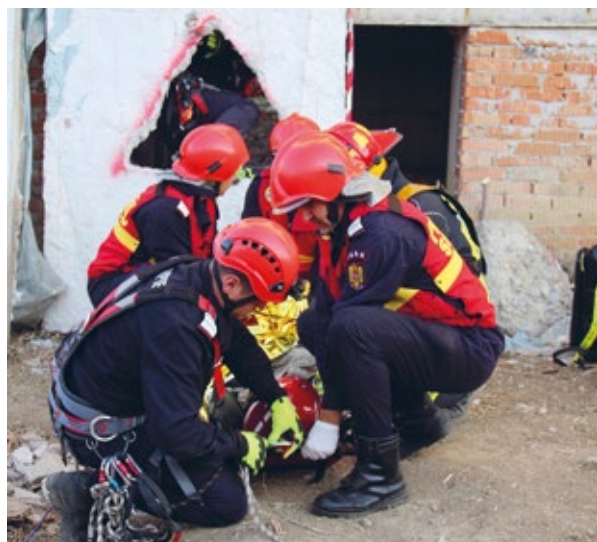
► Rescuing exercises were a major part of the simulation

Under concrete field conditions, this simulation assessed the capacities of the medical teams and experts to coordinate between teams from different countries. Our Hungarian and Finnish JOIN members mobilised their medical helpers and experts and contributed to the success of the exercise.