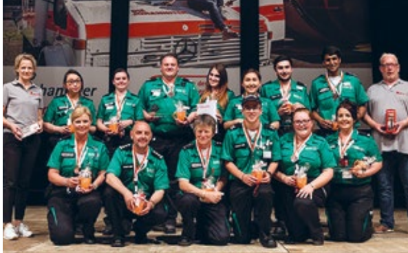
► St John volunteers on the stage

Once every two years, Johanniter Germany organises a 'Johanniter Day' including a major First Aid Competition. This year, hundreds of St John volunteers and staff from all the country and abroad were expected in the city of Bochum. Two teams of St John Ambulance coming from London and from Northern Ireland competed in the First Aid Competition.