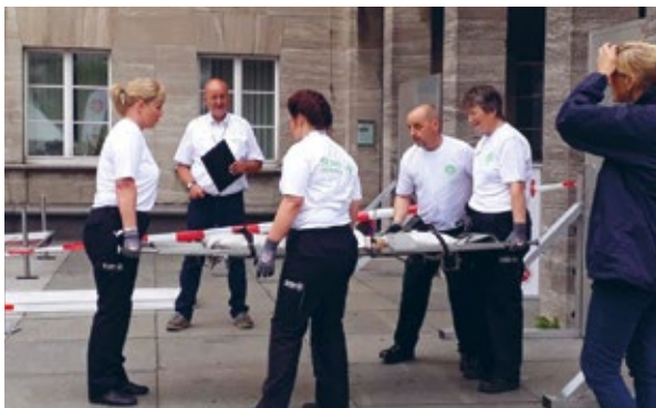
► The volunteers from England and Northern Ireland in action

Saturday morning was an early start, breakfast 7.30am followed by a church service at 8am which all competitors attended. This was a great opportunity to see the range of proud competitors in their uniforms.