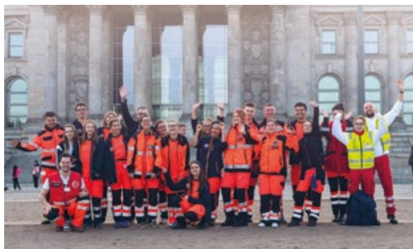
► The group of volunteers from Joannici Dzieło Pomocy Poland

Over the weekend, St John volunteers provided medical coverage at the 45th BMW Berlin Marathon. More than 300 volunteers from all across Germany were present, while 42 volunteers from Austria, England and Poland made this event the biggest swap ever within the JOIN family. This year, a record number of 44,389 runners registered for the Berlin Marathon.